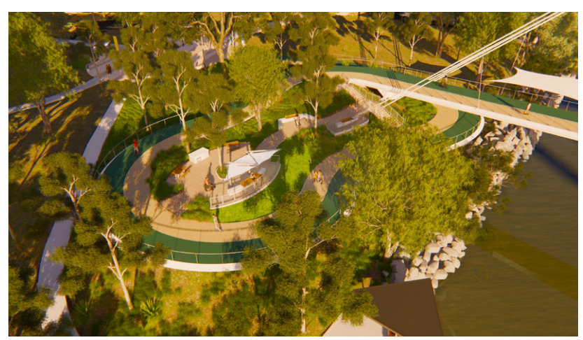
Artist impression of proposed bridge landing in Guyatt Park.