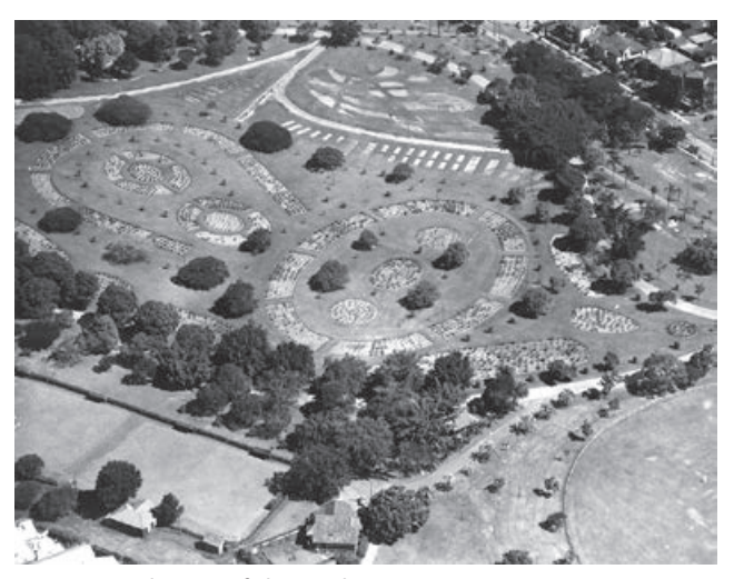
1960 aerial view of the park