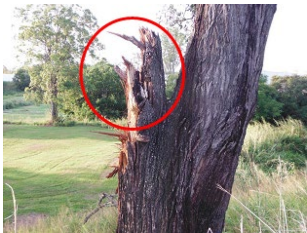
This photo demonstrates a point of concern where a limb meets the trunk of the tree.