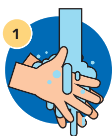
1 Wet your hands