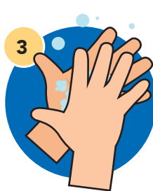
3 Lather and scrub (20 sec)