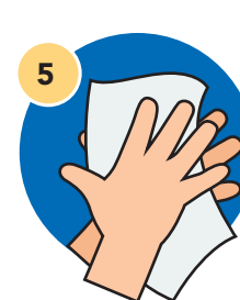
5 Dry your hands