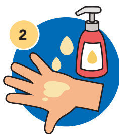
2 Liquid soap