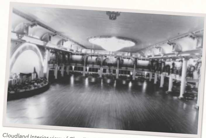
Cloudland Interior view of Cloudland Ballroom, Bowen Hills, ca. 1950, State Library of Queensland, Negative Number 71096

Unfortunately, the amusement park was not a financial success and by 1942 had ceased operations. From about 1947 however,