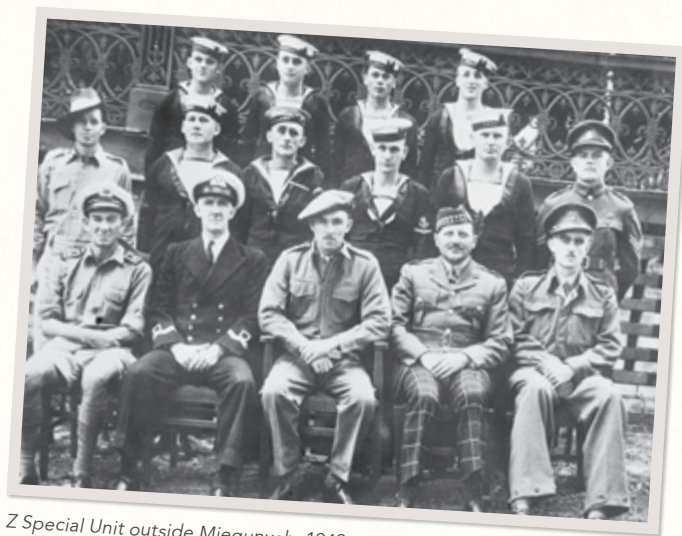
Z Special Unit outside Miegunyah, 1943

The mines caused immense destruction to the Japanese vessels with seven either sunk or damaged badly. The unit recovered at Miegunyah when eventually arriving back in Australia.