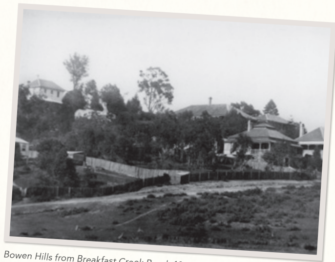
Bowen Hills from Breakfast Creek Road, 1882 (Cintra House at the far left of the photo at the top of the hill), State Library of Queensland, Negative Number 78892

This is private property. Please do not enter.