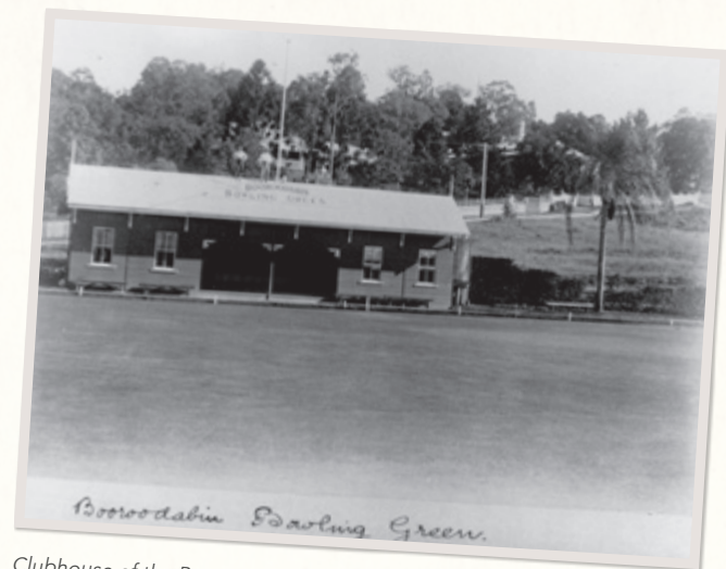
Clubhouse of the Booroodabin Bowling Green, Bowen Hills, Brisbane, 1907

“Now that the club could begin to play on their own ground they would stick together, and do their utmost to