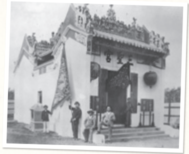
Joss House, Breakfast Creek, 1886, State Library of Queensland, Negative Number 10124

for a few hours while the display was going on. Great preparations for feasting have been made, and it is probable that the opening ceremony will last as long as the food holds out and visitors attend.” ( Telegraph , 21 January 1886)