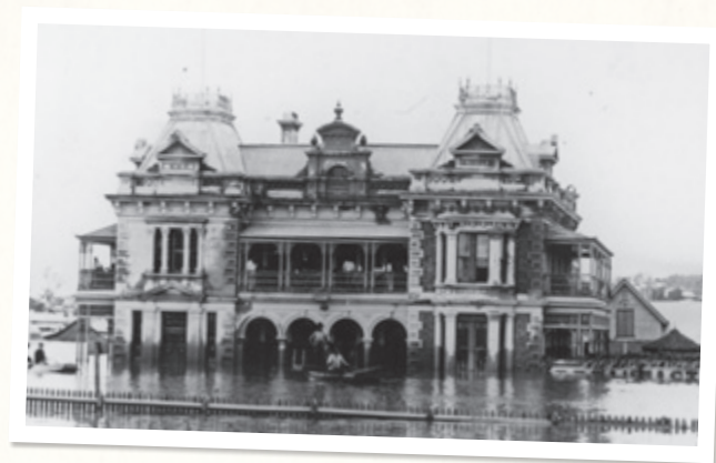
Flooding at the Breakfast Creek Hotel, 1893, State Library of Queensland, Negative Number 99230

The hotel provided guest accommodation with 10 bedrooms and a drawing room on the first floor, and there were the stables, coach house, kitchen and servants quarters at the rear of the hotel.