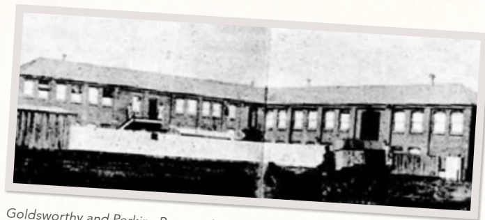
Goldsworthy and Perkins Boot and Shoe Factory, Queenslander, 28 July 1900

It was, however, an industry plagued by industrial unrest. Conditions for both male and female employees at this time were so dire that the Royal Commission into Shops, Factories, and Workshops was undertaken in 1891.