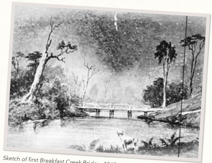
Sketch of first Breakfast Creek Bridge, 1840, Brisbane City Council, BCC-B54-8550

The creek we know today as Breakfast Creek and the land surrounding it, particularly on the Newstead side, seemed to Oxley an ideal place to establish the fledgling European settlement. There was fresh water, high ground for security, and safe mooring for ships. Agreeing with Oxley, Chief Justice Forbes named the point 'Edenglassie'. In December 1824 the newspapers reported that "the river is half-a-mile wide in this eligible position for a settlement; having ten fathoms water, possesses good anchorage, and has, by nature, a wharf already complete" ( Hobart Town Gazette , 31 December 1824).