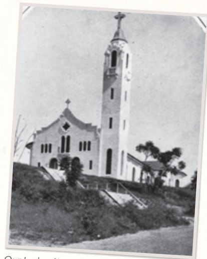
Our Lady of Victories Catholic Church at Bowen Hills, 1928, State Library of Queensland, Negative Number 71096

The cross above the tower was intended to be perpetually lit as a commemoration of the armed forces during World War I. Within the church the Australian Imperial Force symbol of the rising sun is depicted in glass panels.