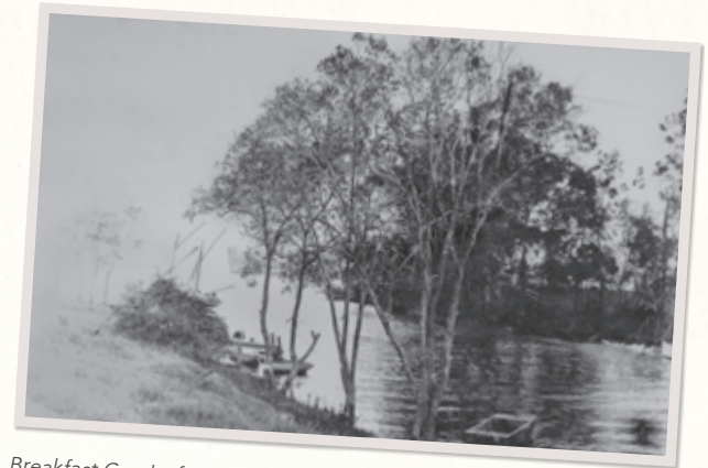
Breakfast Creek after Newstead House grounds were cleared, undated, State Library of Queensland, Negative Number 117016

An example of this occurred in October 1860 when a party of five policemen and several volunteers carried out a violent raid on one of the large camps at Breakfast Creek, firing shots which caused the frightened people to flee the camp. The police then proceeded to throw the camp residents' belongings into the river and set fire to all of the gunyahs (Aboriginal shelters).