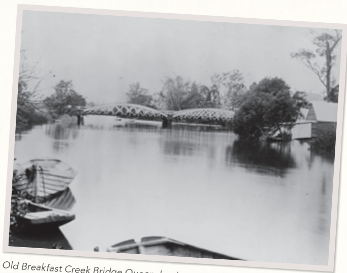
Old Breakfast Creek Bridge Queensland, ca. 1887, State Library of Queensland, Negative Number 100721

With the closure of the penal settlement in 1839, the area was opened for free settlement after 1842. By 1858 a permanent bridge had been built across the creek. As the district expanded and prospered, the old bridge could no longer cope with the traffic and a new bridge was proposed. The Breakfast Creek Bridge Board was formed to oversee the project and it was completed by May 1889, following several setbacks such as exceeding the initial budget.