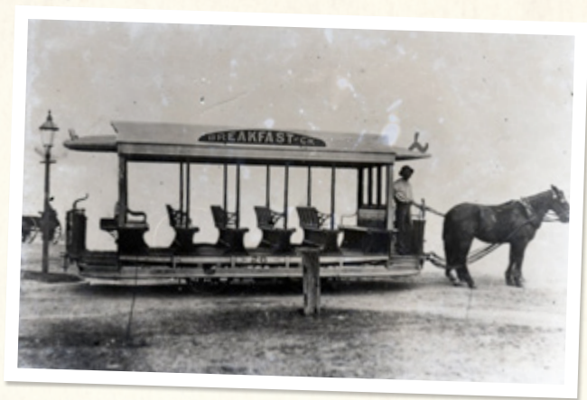
Horse drawn tram to Breakfast Creek, 1886, Brisbane City Council, BCC-B54-11732

The convict settlement was closed in 1839 and in 1842 Moreton Bay was officially opened for free settlement as part of the colony of New South Wales. Newstead House was built in the early 1840s and the area slowly began to be developed for housing and industry. The large hill, often called Montpellier Hill, within the suburb we know today as Bowen Hills, was settled and several large estates were established on it in the 1860s, including Cintra House and Montpellier. On the lower-lying land workers' cottages dotted the area, and by 1879 the Booroodabin Divisional Board had been established to help guide the district's progress. In 1885 a horse-drawn tram line carried passengers to the Breakfast Creek Bridge.