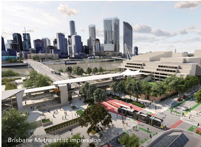
Brisbane Metro artist impression

Council's transport plans and strategies, including the Transport Plan for Brisbane – Strategic Directions , address challenges and harness opportunities to guide further development of the transport network. Projects like the Brisbane Metro will improve mobility, reduce congestion and enable opportunities for sustainable urban development throughout the city and suburbs.